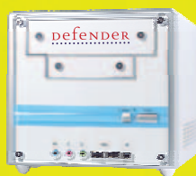
Small footprint server

automatic updates firewall email server file server automated backup server anti-virus KASPERSKY Lab anti-spam content filtering vpn user controls open exchange/groupware intrusion prevention vulnerability assessments internet gateway/web cache web server fax server windows network integration network server world class support